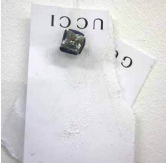
Dan Bell guu / ucci 2011 (detail) perfume sample cards, sweat, ear rings, fimo 6.0 x 8.0 x 1.0 cm

items from their intended function and propels them into the position of subjective art objects with libidinous and expanded import. Taking tube socks, vases, denim, posters and other objects sourced from the detritus of a bedroom or studio, Vivian stretches, stuffs, and otherwise distresses his materials. As Nicholas Tammens writes, through Vivian's modifications and contortions the objects 'transgress their own domesticity'. 3 While losing their utility, the objects' formal qualities, and sculptural and symbolic possibilities are emphasised and tested.