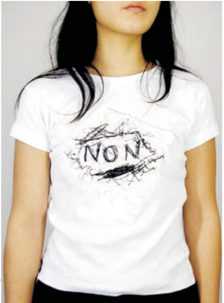
Laetitia Bourget NON 2002