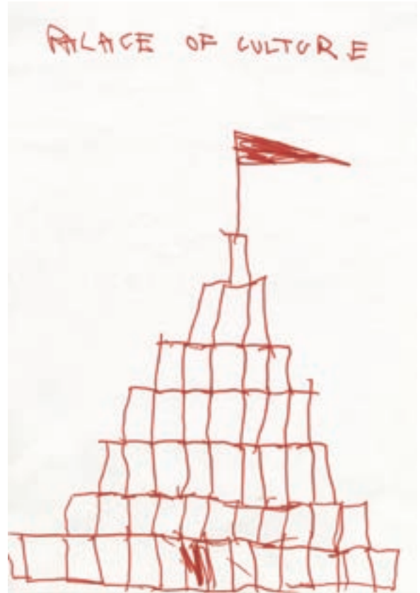
Ania Walwicz Palace of Culture 2005

Walwicz' societal institutions are seen through observations of peculiar machinations, coupled with personal remarks and possibly 'tensed' perceptions. Maybe it's paranoiac; maybe visceral, could be cathartic. These text drawings and drawings of text are notational and fragmentary; considered, careful, at times intimate and fragile. They describe the relations between one thing to another and of individuals to systems.