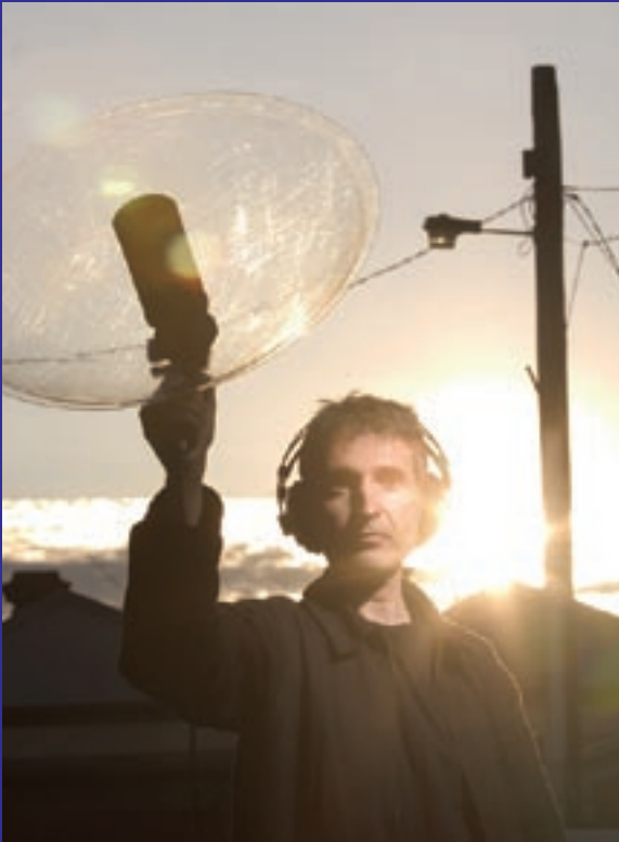
Philip Samartzis Captured Space 2005

Philip Samartzis' surround sound installation ' Captured Space ' (2005) was developed to change '... the acoustic dimension of Alliance Française through an imperceptible soundtrack that (unheard or even forgotten) forms densities of space and newly developed aural zones through latent sounds. ' Captured Space ' interacts with the sounds of the location to render new and complex readings ... ' subtly subverting any perception of a seamless aural experience. Samartzis commingles the actual and daily sounds of the Alliance with introduced layers of recorded aural elements that ... permeate through acoustic spaces like perfume: refrigerator noises; fluorescent lights, computer hum, air conditioning; vibrating pipes; vending